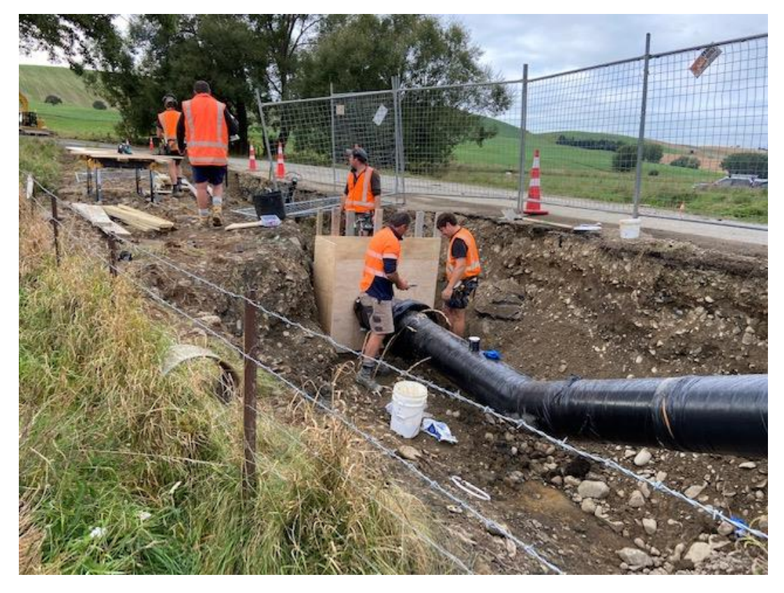
Contract 2470 – Pareora Pipeline Renewal Section 3 (photo taken close to project completion).