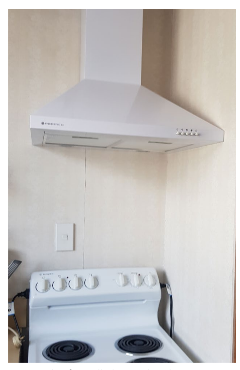
Example of installed range hood.