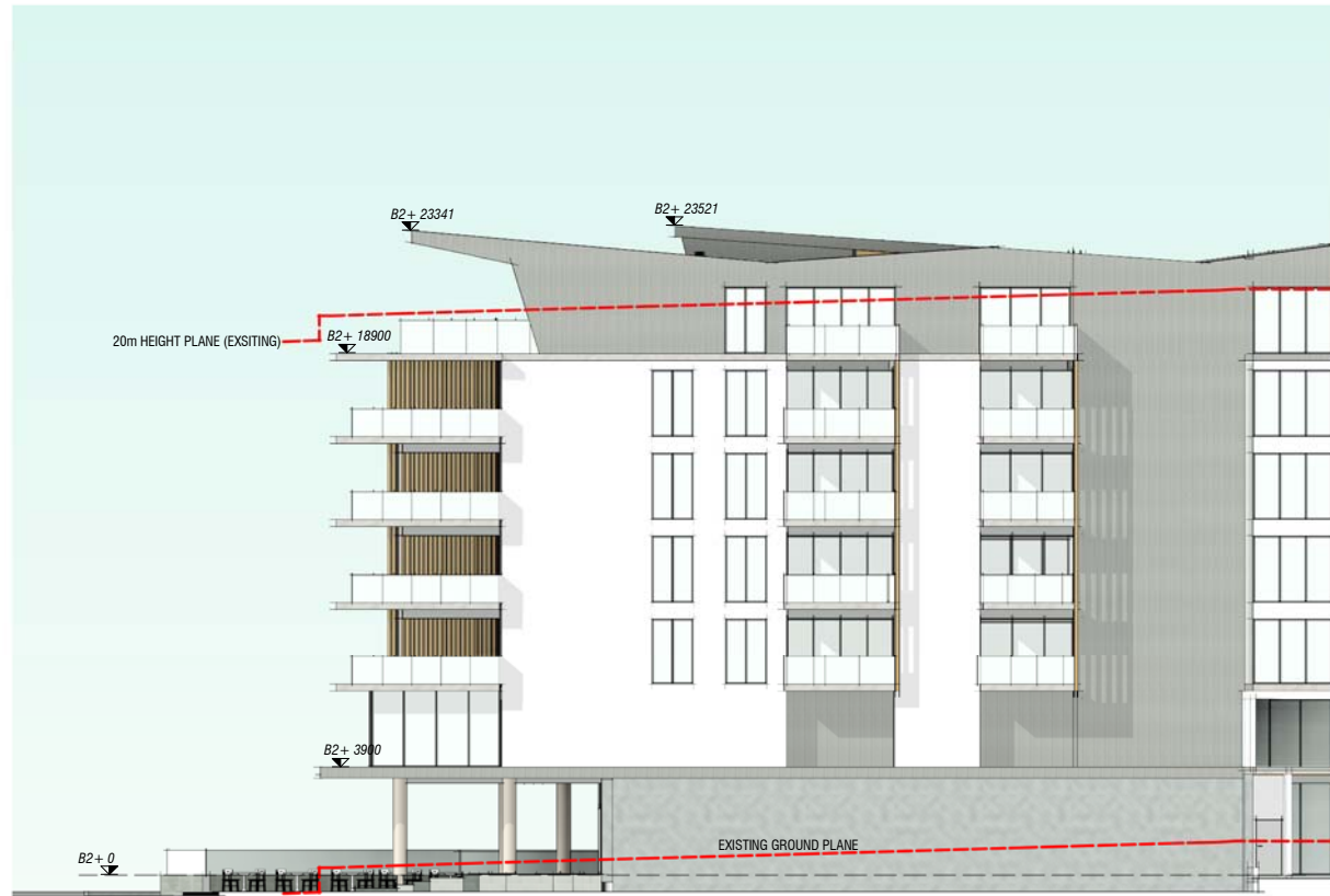
1 INTERNAL BOUNDARY ELEVATION - WEST (A) Scale: 1 : 150