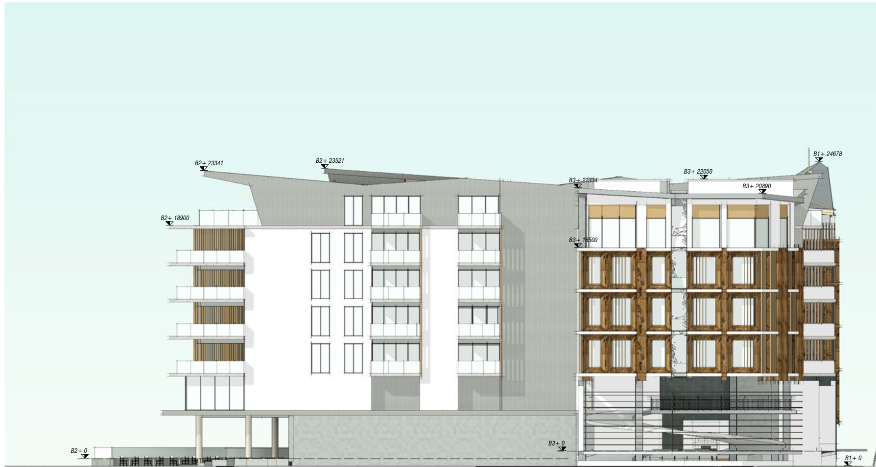
1 WEST ELEVATION Scale: 1 : 150