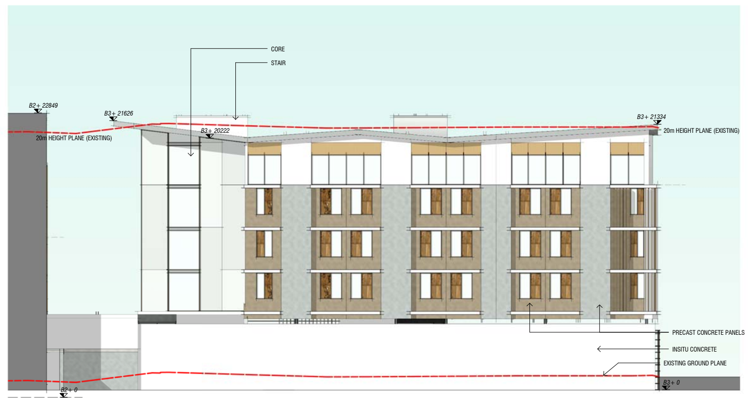
1 INTERNAL BOUNDARY ELEVATION - NORTH Scale: 1 : 150