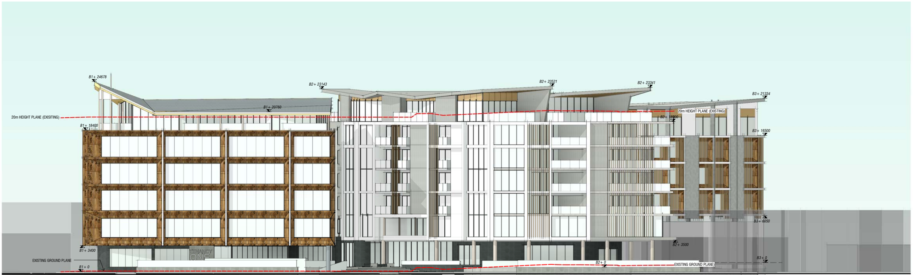
1 EAST ELEVATION Scale: 1 : 150