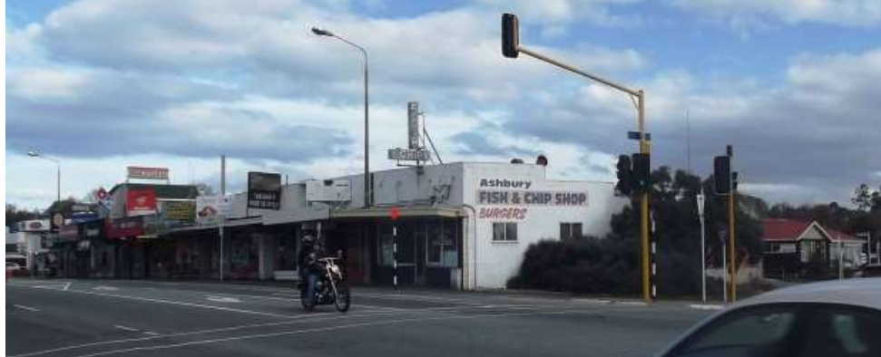
The buildings that should be removed