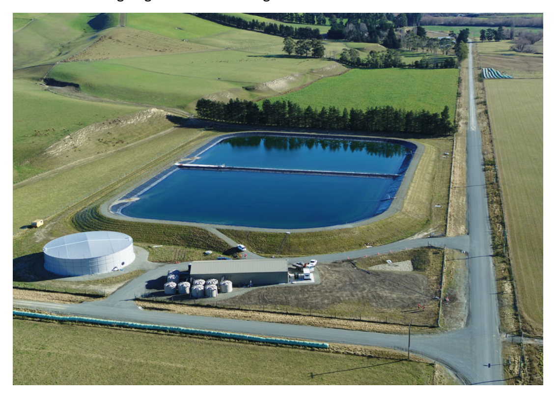
Drone photo of Te Ana Wai Water Treatment Plant, Treated Water Reservoir and Raw Water Storage Ponds.