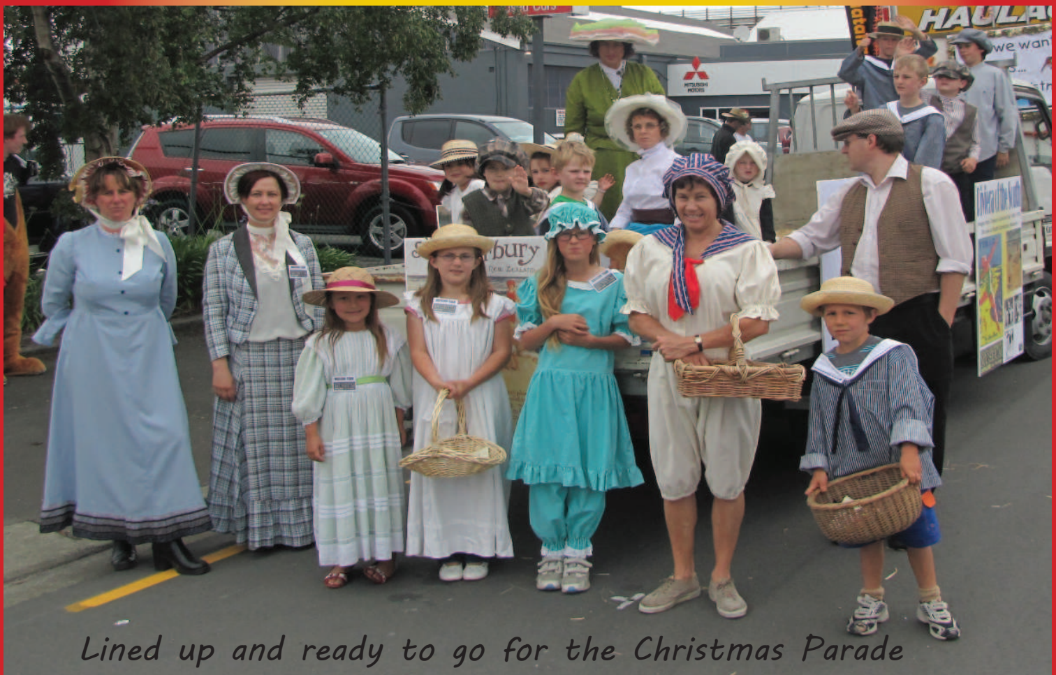
Lined up and ready to go for the Christmas Parade

Watch out for the information about sessions in each newsletter.