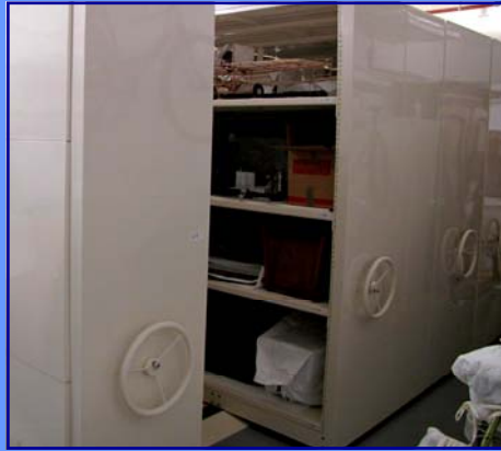
Above: Museum artefacts stored in high-density mobile shelving in the basement storage area.

This role is of equal importance to the more public roles of exhibition and education. Careful collection management and growth ensures that vital aspects of our region's