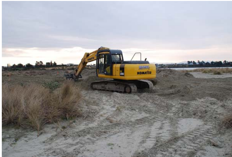
Earthmoving equipment starts work on the new carpark close to Marine Parade.