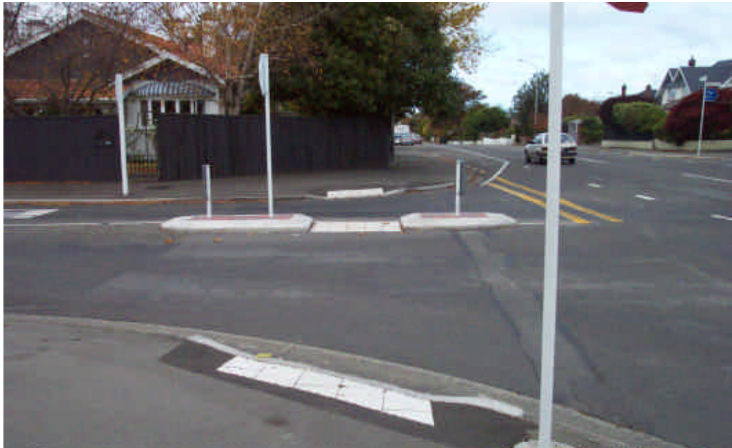
Typical road crossing layout

There are a number of design documents available that recommend minimum features and standards for walking and cycling facilities (See 11.3 References).