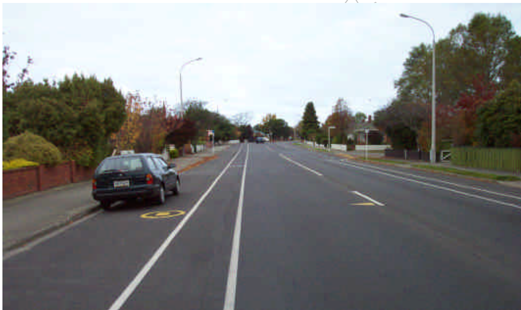
Cycle Lane on Main Roads