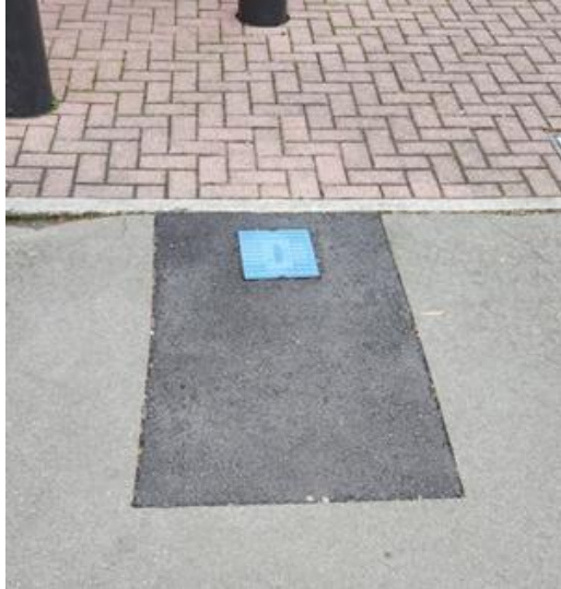
Depicts a non-compliant reinstatement

Concrete (AC) in footpaths must be fully replaced full width (boundary to kerb).