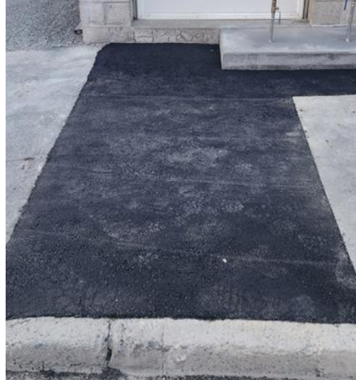
Depicts a compliant reinstatement