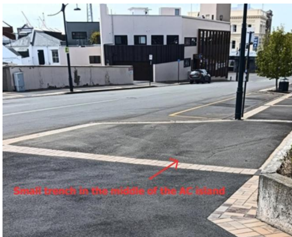
Depicts a non-compliant reinstatement

Asphalt Concrete (AC) islands in footpaths must be fully replaced when excavated.