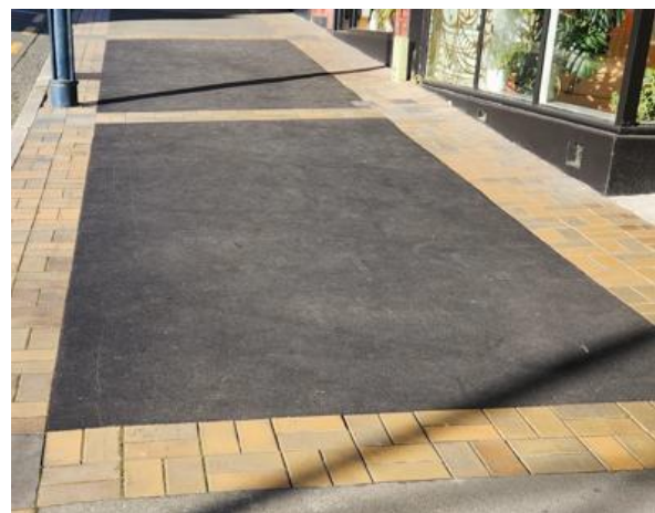
Depicts a compliant reinstatement