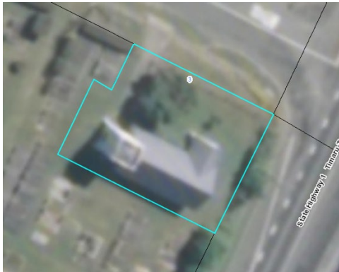
Extent of scheduling, 3 Huirapa Street, Arowhenua.