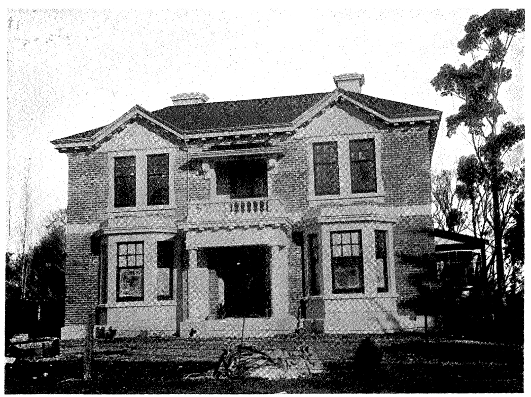
'The New Presbyterian Manse at Temuka'. Otago Witness 2 August 1911, p. 48.