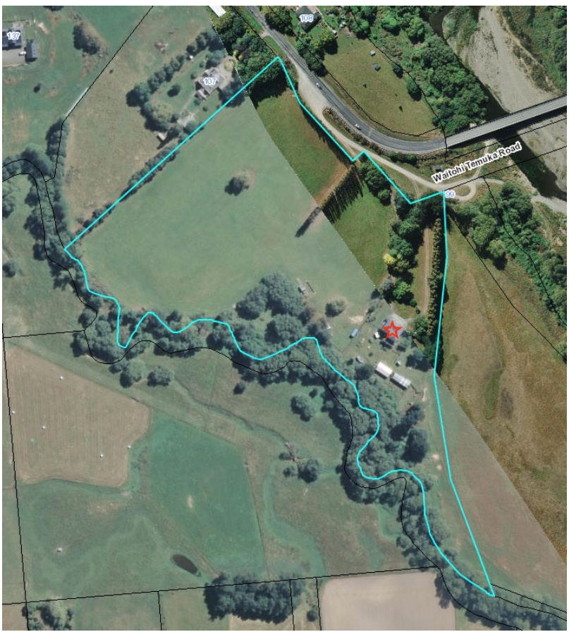
Land parcel as a whole, with house marked by star.