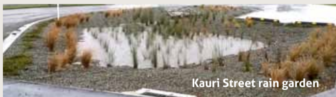
Kauri Street rain garden