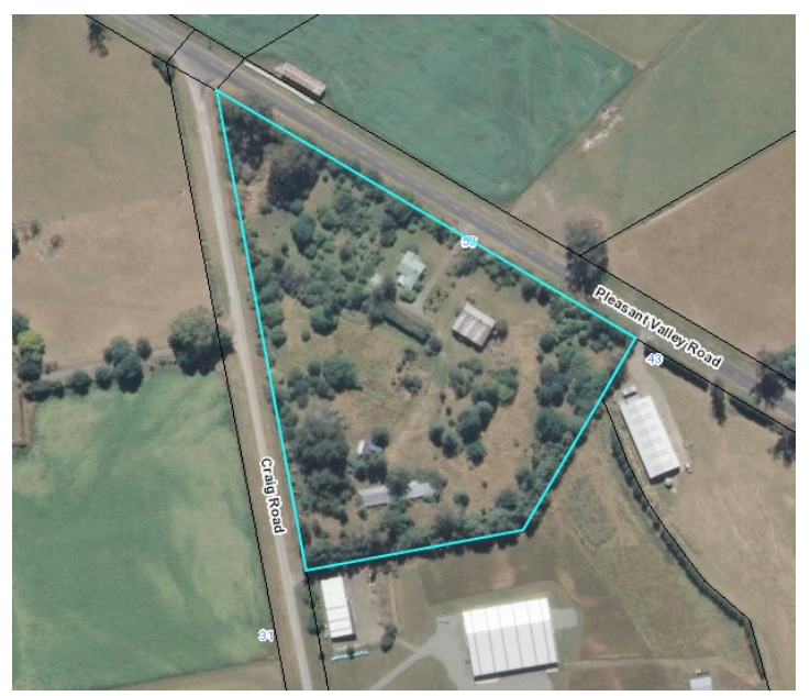
Land parcel as a whole.