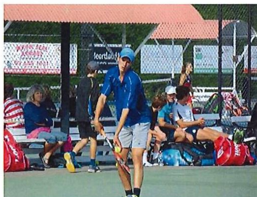
Students compete in the South Island Secondary Schools Bowls and Tennis Championships

It is pleasing looking forward that the Timaru District will be hosting the national school's netball finals in October, the SISS Cycling Championships for the first time in July, the inaugural SISS satellite Basketball champs in September and has recently been awarded the National School Cross Country championships in June. All events are high in competitor numbers and will bring large number of visitors to the community.