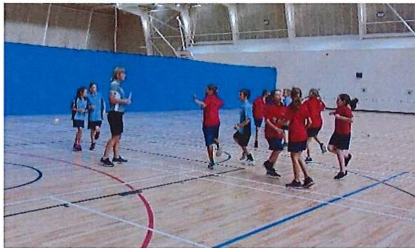
PALS students learn a new game

57 students from eight schools attended the full day PALS (Physical Activity Leaders) workshop in April. These students learn the importance of being a role model, how to plan when delivering an activity, and the best way to meet your participants needs when leading a session