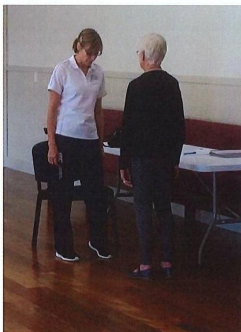
A patient is assessed for the falls prevention programme

Sport Canterbury is a member of the national lead agency for the new live stronger for longer campaign ensuring that consistency and quality is delivered to the project nationwide. This position engages representatives throughout the country as well as the ACC.