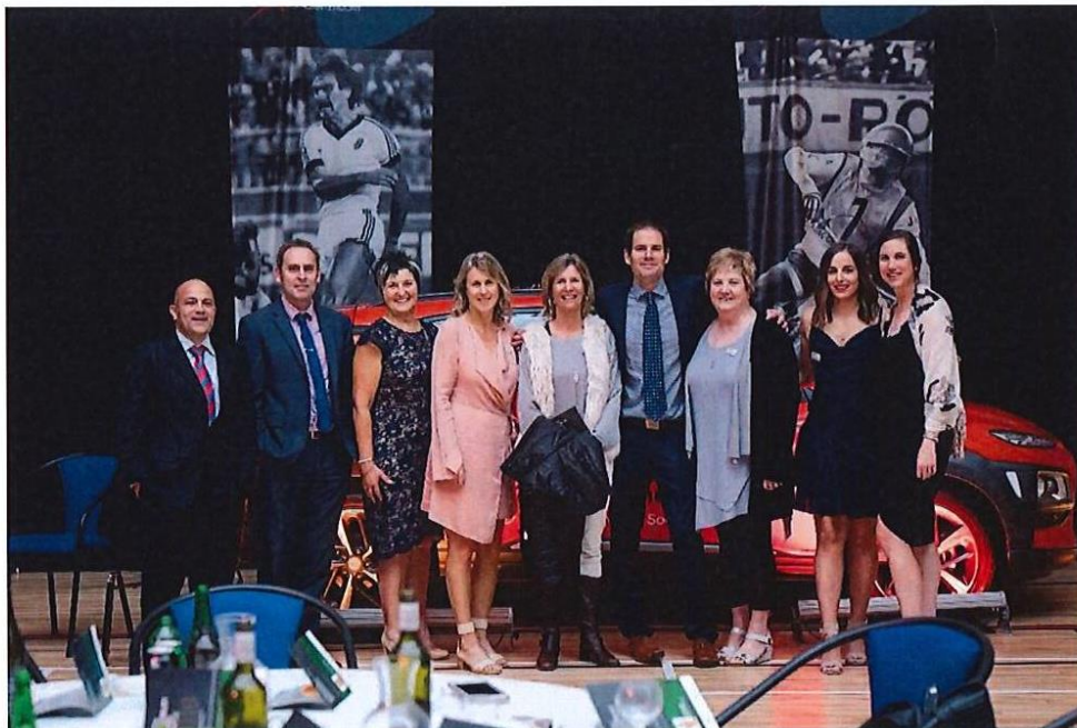
The Sport Canterbury Team

We are building towards having well-functioning community organisations facilitating our sport.