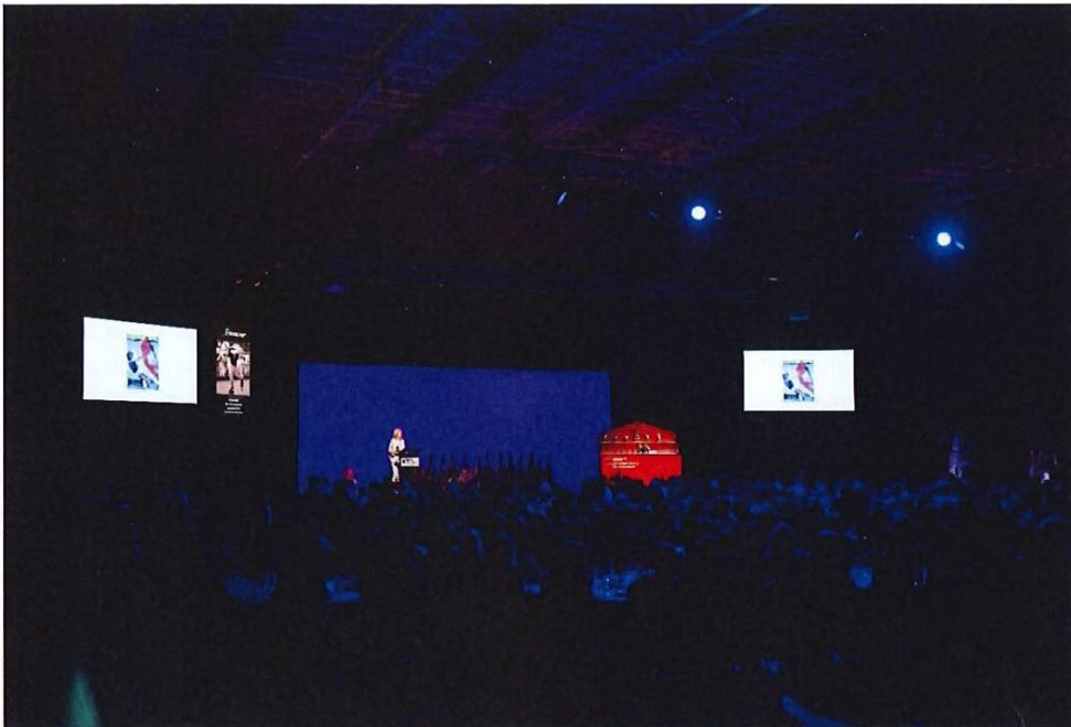
The South Canterbury Sports Awards setup 2018

In May we celebrated the 52nd South Canterbury Sporting Excellence Awards. The event was attended by more than 450 people and we received over 70 nominations in categories ranging from young sportsperson, sport event and administrator of the year. The 2018 guest speaker was the legendary Barbara Kendall, she shared her story reflecting on an amazing sporting career that continues to blossom as an international administrator. The quality of the finalists was high reflecting the contribution South Canterbury makes to sport on the national and international stage. The Timaru Super Shot that was well supported by the Timaru District Council and won the Sport Event of the Year award and shot put world champion Tom Walsh captured his first South Canterbury sportsperson of the year title.