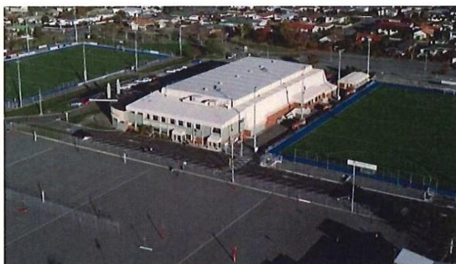
Aerial view of Aorangi Park

The draft strategy is still open for feedback until 30 th July 2018.