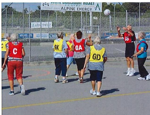
Participants at the older persons have a go day engage in walking netball

Men's health week occurred in June and a number of programme facilitators provided free opportunities to men. While across the community the uptake was low some have remained in the programmes and joined as members.