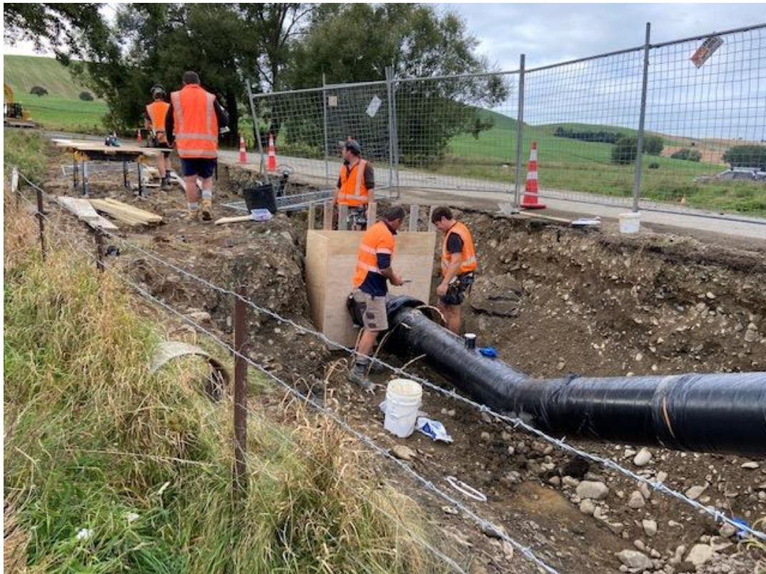
Contract 2470 – Pareora Pipeline Renewal Section 3 (photo taken close to project completion).