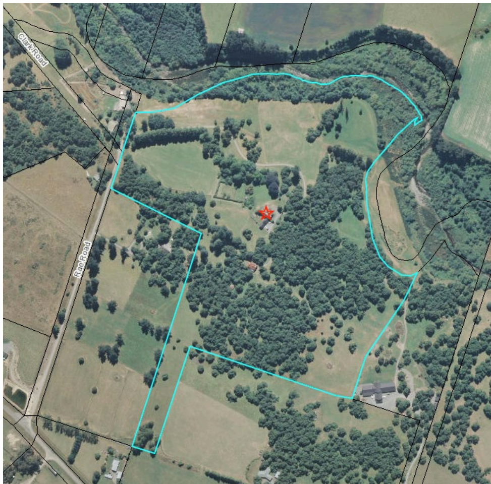
Land parcel as a whole, with house marked by star.