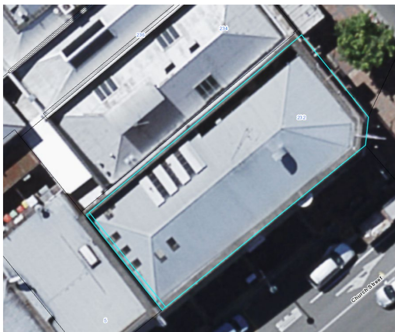
Extent of setting, 232 Stafford Street, Timaru.