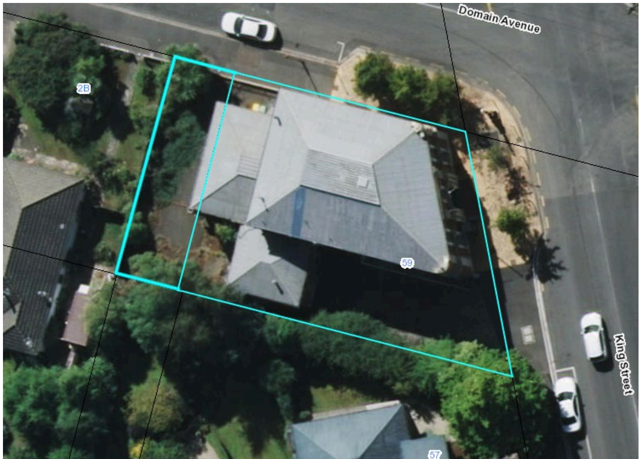
Extent of scheduling, 59 King Street, Temuka.