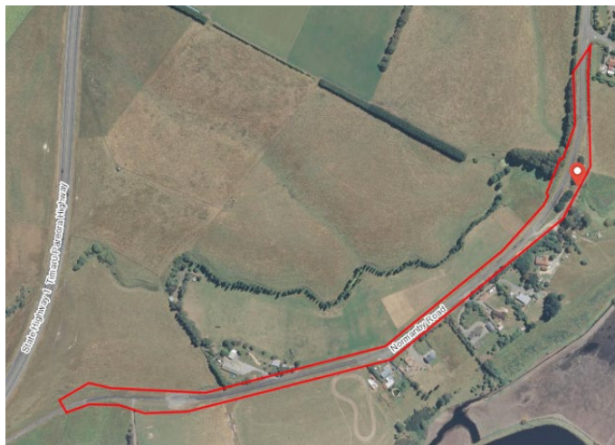
Normanby Road, Normanby, with bridge site marked by pin.