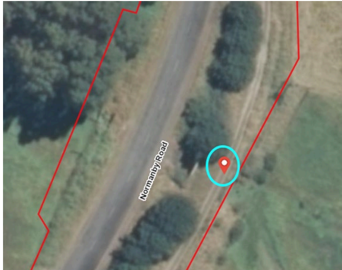
Extent of setting, Normanby Creek, Normanby Road bridge.