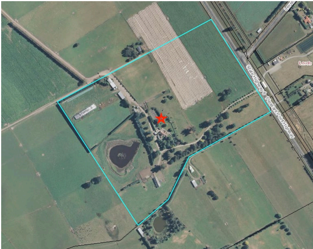
Land parcel as a whole, cottage site marked by star.