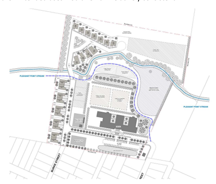
Figure 2 Early-stage conceptual plan - subject to change

Figure 2 is an early-stage conceptual layout to provide context behind the thinking around integration of residential, environment and agriculture. Note that this is very much something just to get the conversation going and all relevant stakeholders have not been properly consulted for input at the time of writing this. The overall design would be subject to tweaking and spatial adjustments that suit the topography of the site and final configuration of possible water feature, but the proportions of the footprint and their intended uses would remain relatively consistent.