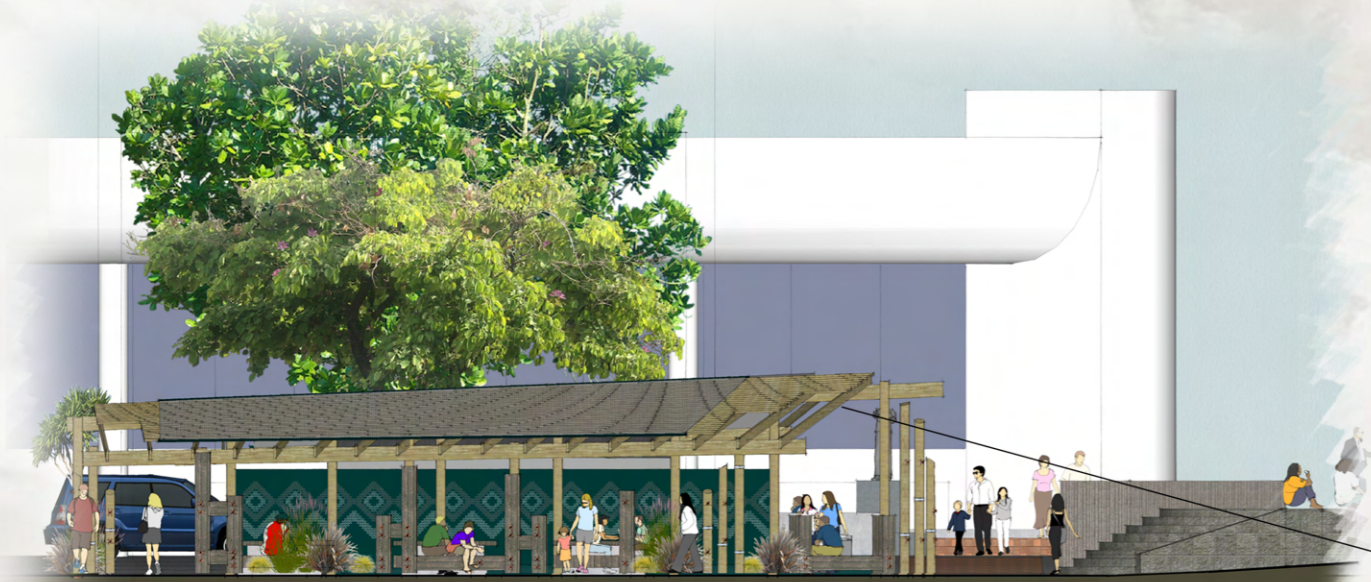
north elevation - street scene