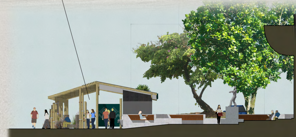
west elevation - through ramp to existing seating