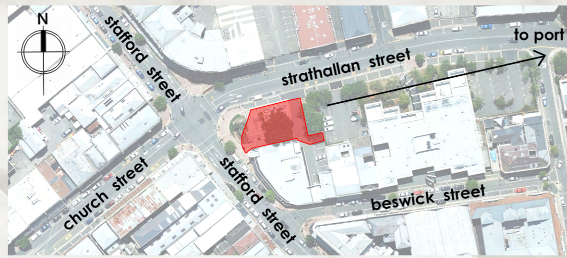
site location plan