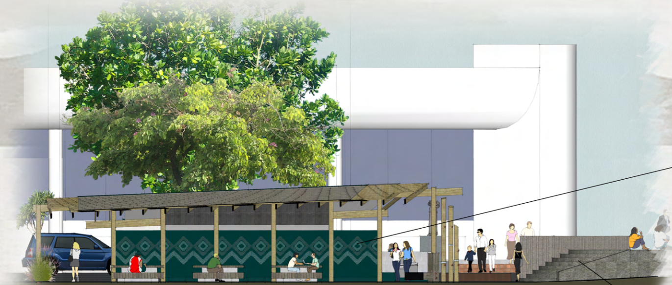
north elevation - seating area