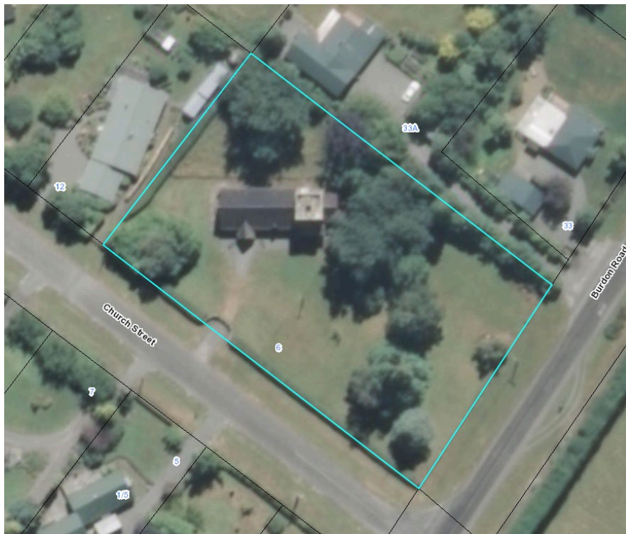
Extent of scheduling, 6 Church Street, Woodbury.