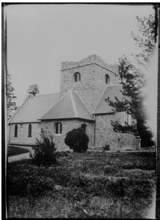
Church before erection of 1937-38 stone nave. 4-6769, Sir George Grey Special Collections, Auckland Libraries.