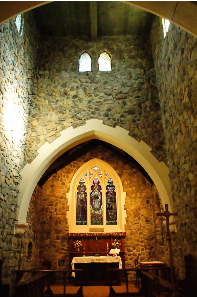
Interior view looking towards Whall window in the sanctuary.