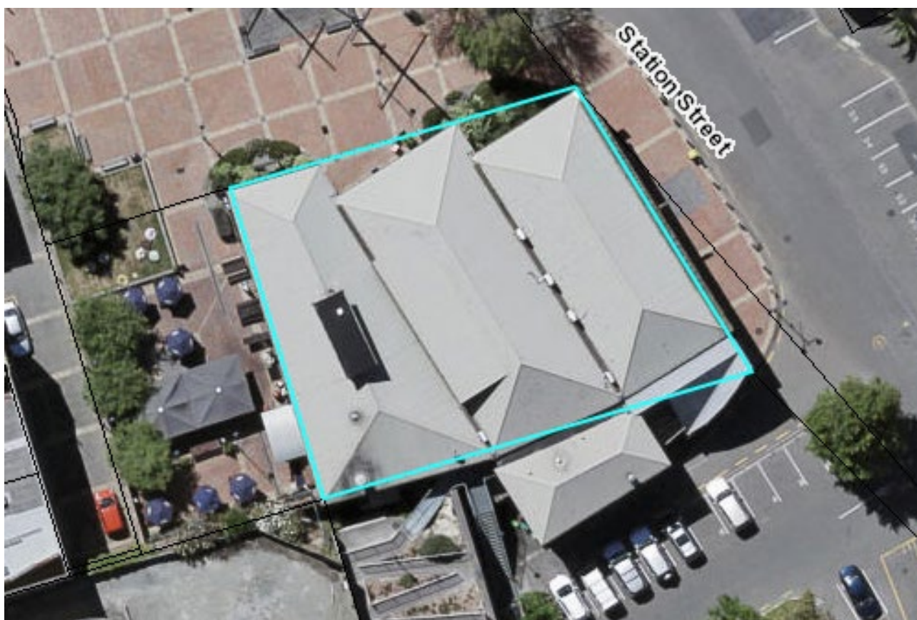
Extent of setting, 2 George Street, Timaru.