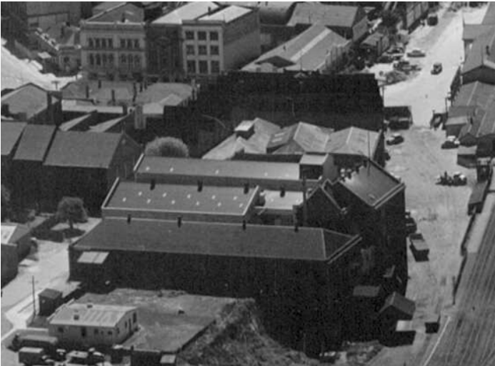
Detail from October 1956 aerial showing stone stores surrounded by later warehousing erected by the NZ Loan and Mercantile Agency and Dalgety & Co.

Timaru Herald 3 September 1873, p. 2. PapersPast.