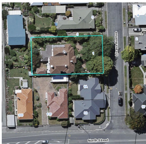
Extent of setting, 1 Lisava Avenue, Seaview, Timaru.