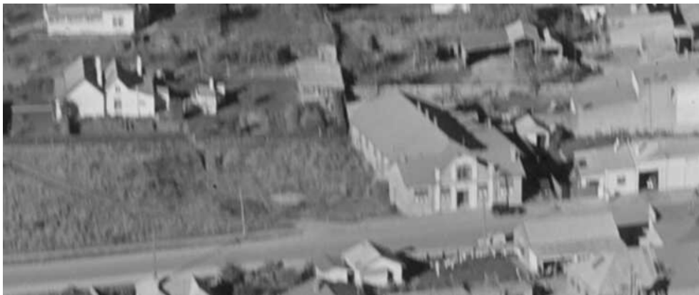
View of building before extension undertaken and war memorial relocated, 1951. WA-28068-F, Alexander Turnbull Library, Wellington.