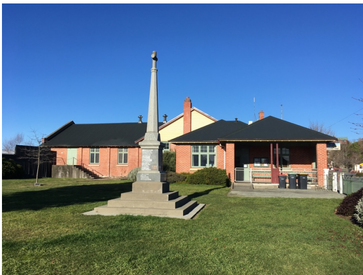
War memorial and north elevation showing 1953-54 extension.