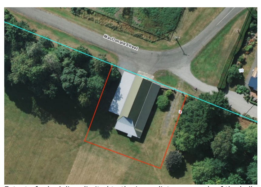
Extent of scheduling, limited to the immediate surrounds of the hall and including the centenary entrance gates, 8 Macdonald Street, Orari.