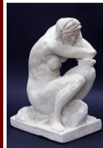
Assemblage of Space

This year Polychrome will display artworks by Ara Post-graduate Arts and Media students from both the Christchurch and Timaru campuses. It includes a diverse range of styles and celebrates the artistic talents of the region.