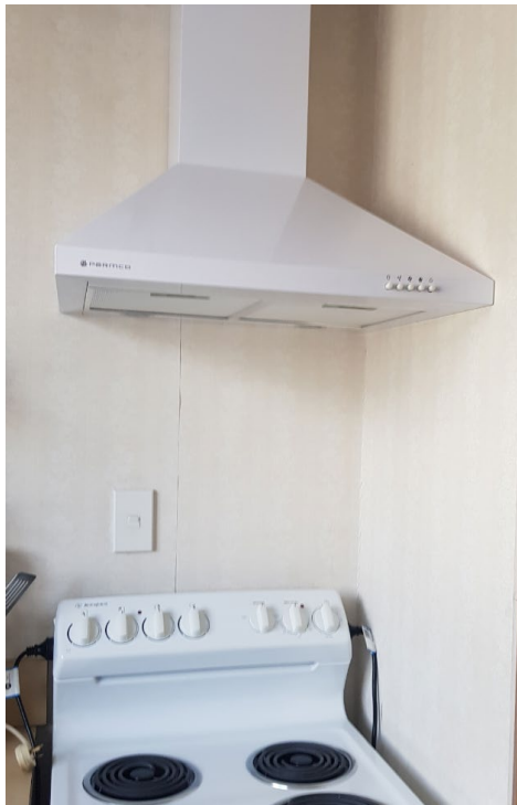
Example of installed range hood.