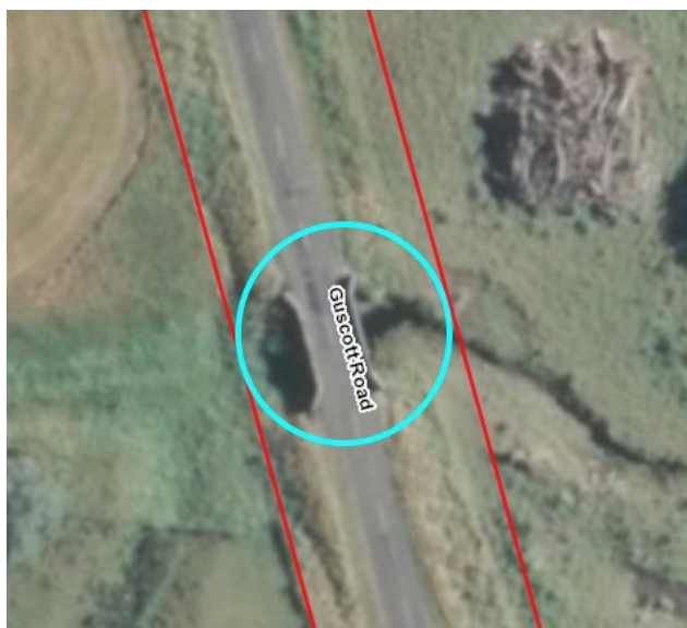
Extent of setting, bridge over Pighunting Creek, Guscott Road, Pareora West.