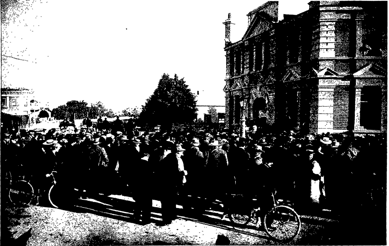
Unveiling ceremony.