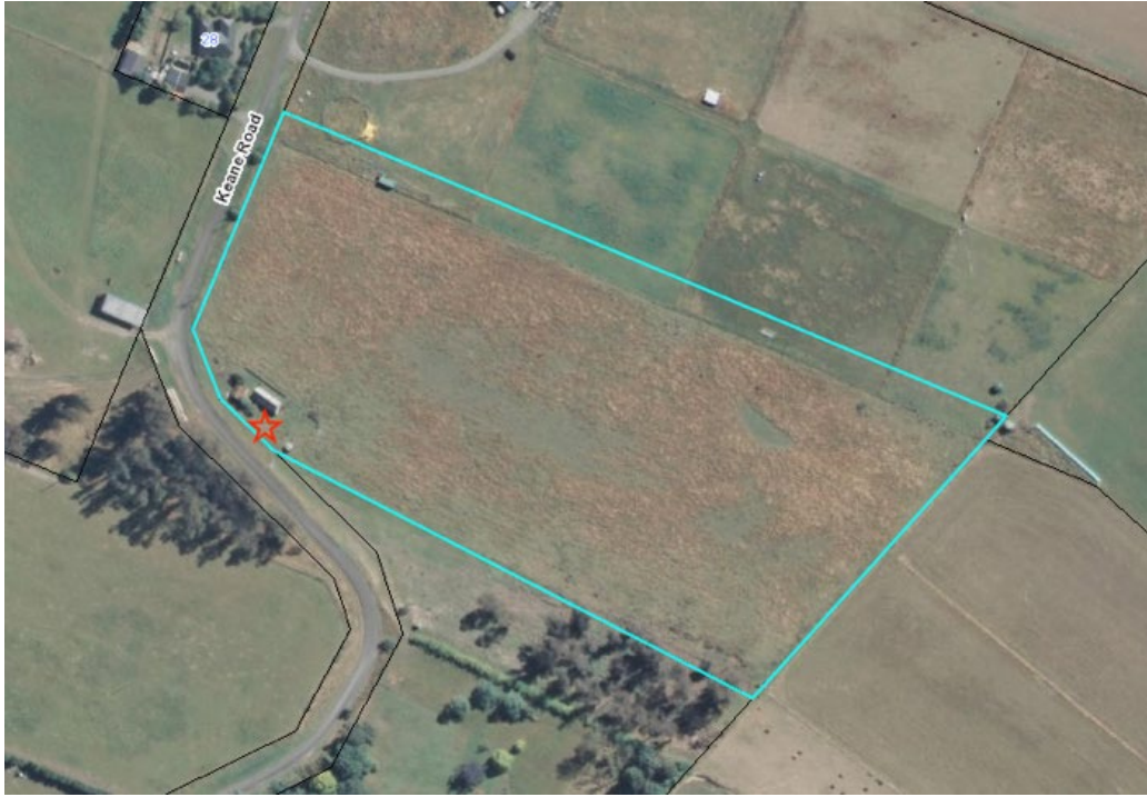
Land parcel as a whole, with cottage site marked by star.