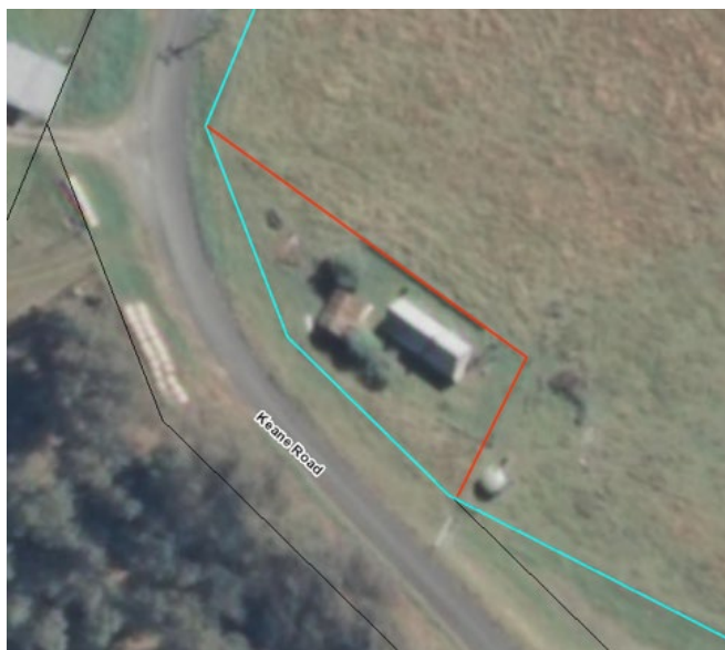
Extent of setting, Keane Road, Levels Valley.