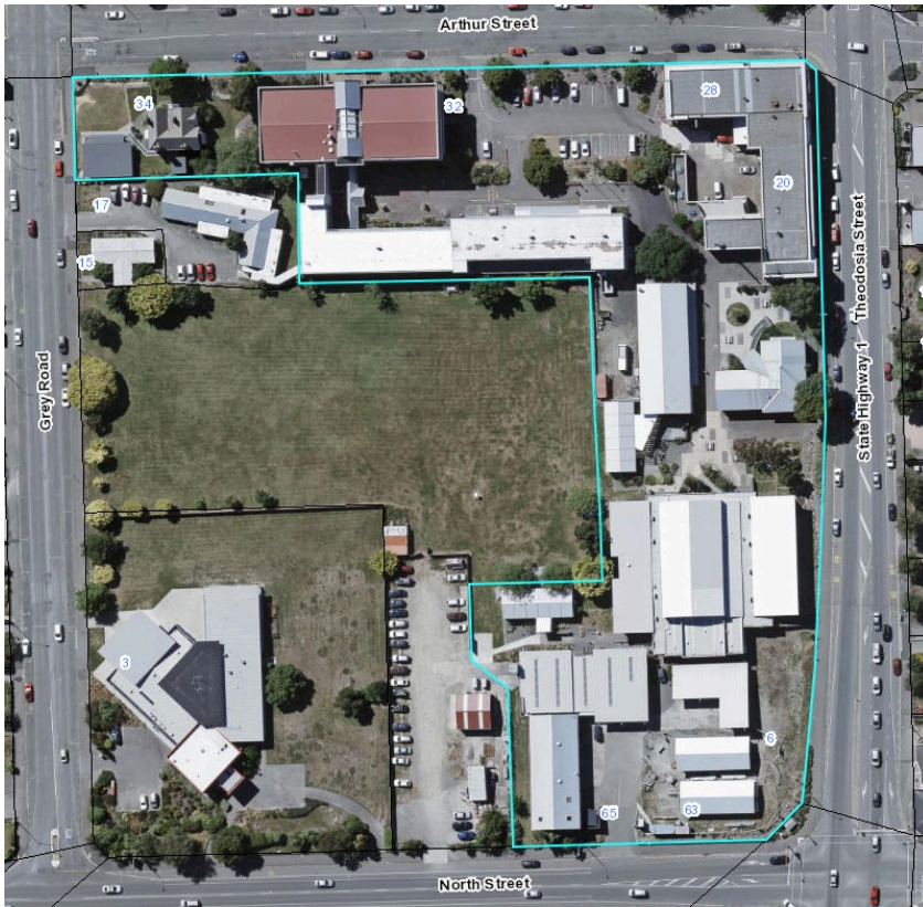
Land parcel as a whole.