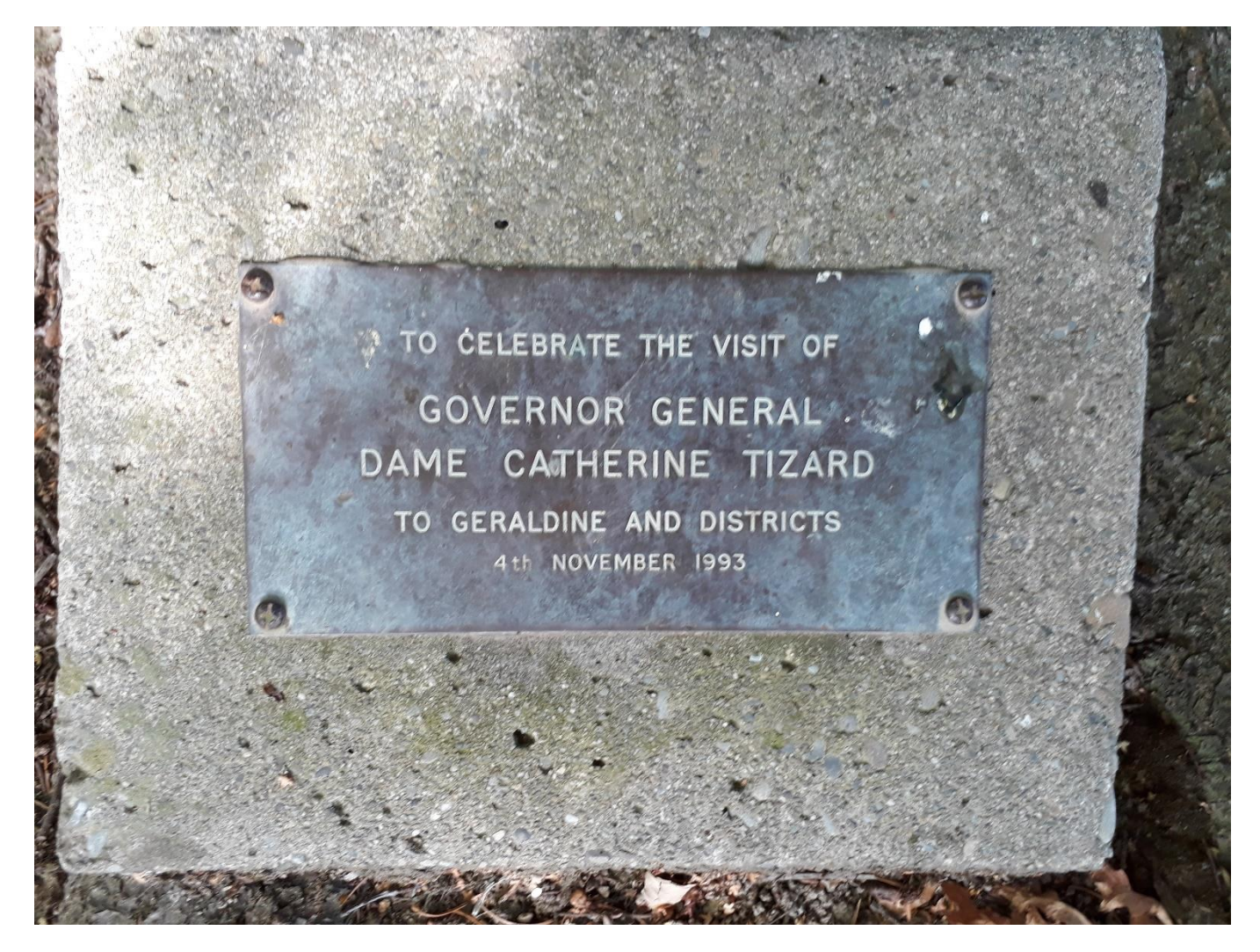
Plaque states, "To celebrate the visit of Governor General Dame Catherine Tizard to Geraldine and Districts 4th November 1993"

Assessment by: Peter Thomson Date: 5/7/1995