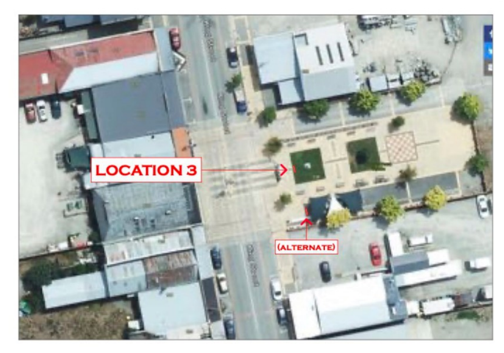
TEMUKA TOWN CENTRE - HERITAGE PANELS, King St., Temuka