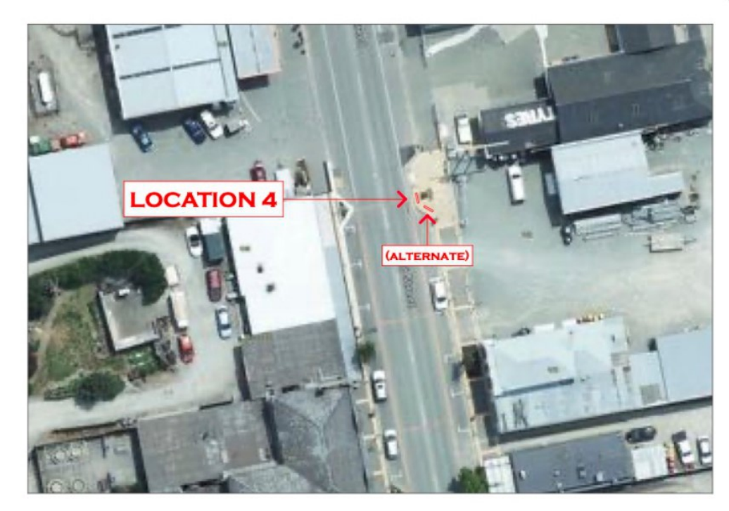
TEMUKA TOWN CENTRE - HERITAGE PANELS, King St., Temuka