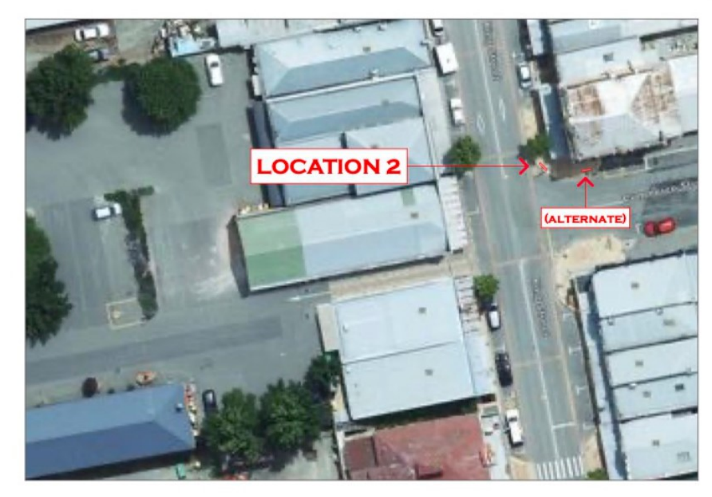
TEMUKA TOWN CENTRE - HERITAGE PANELS, King St., Temuka