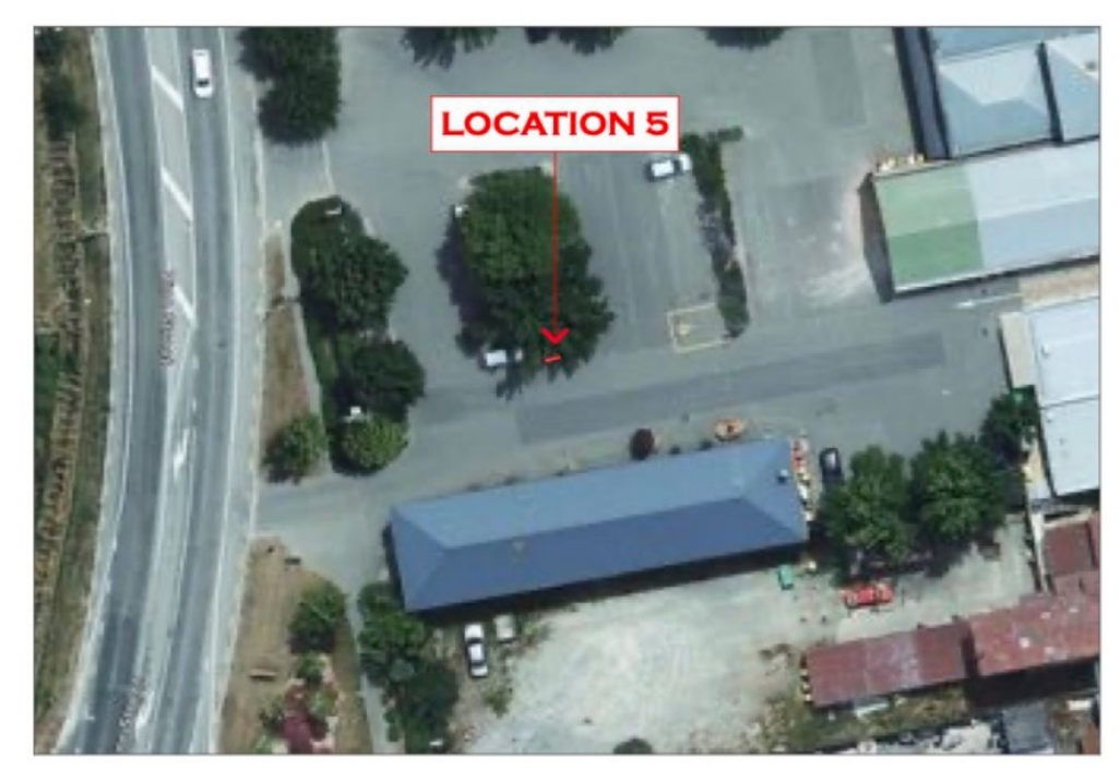
TEMUKA TOWN CENTRE - HERITAGE PANELS, King St., Temuka