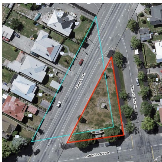
Extent of setting, plot bounded by King Street, Memorial Avenue & Catherine Street, Timaru.