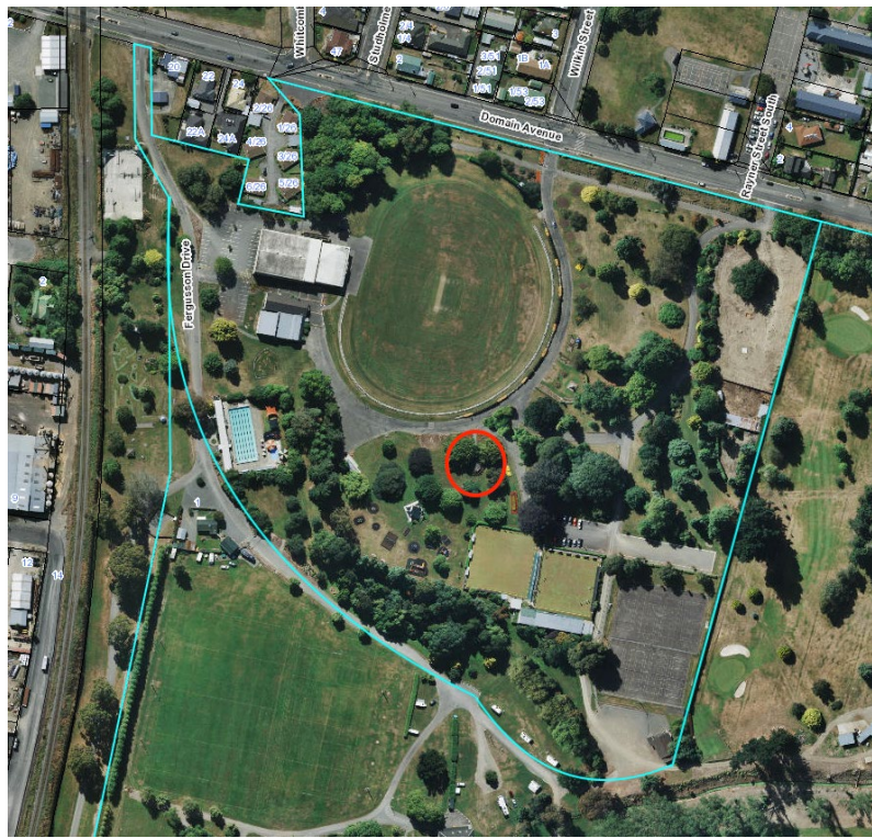
Extent of setting, limited to immediate surrounds, Temuka Domain, Domain Avenue, Temuka.