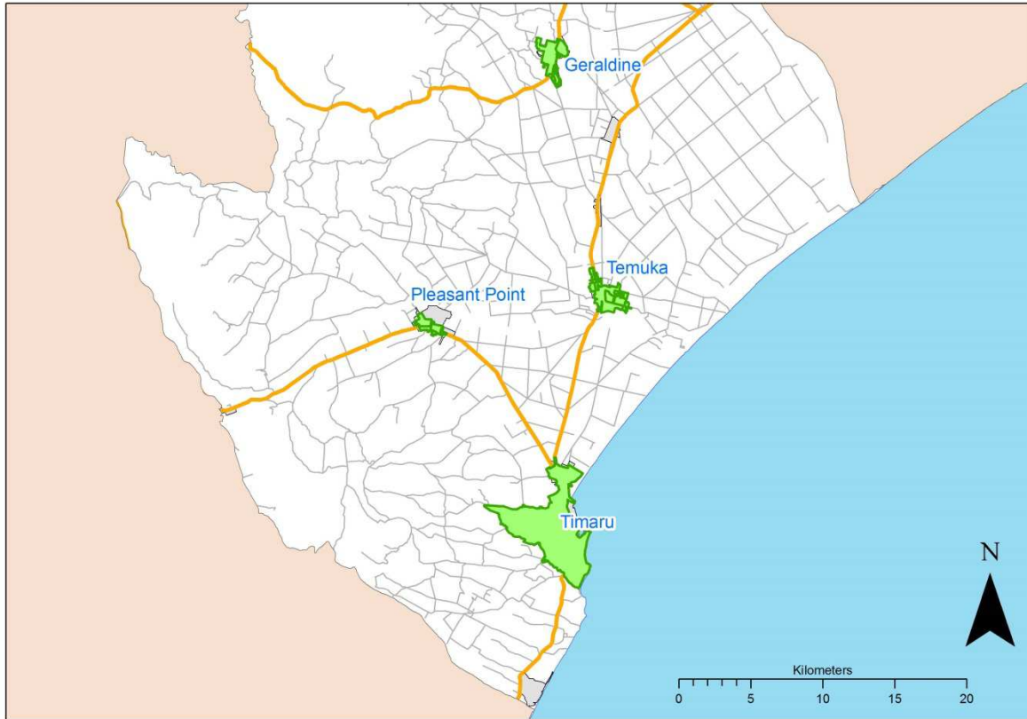
Figure 2. Timaru District Urban Stormwater Schemes

The Figure below shows the coverage of this Strategy. These are TDC's urban stormwater schemes servicing the townships of Timaru, Temuka, Geraldine and Pleasant Point.