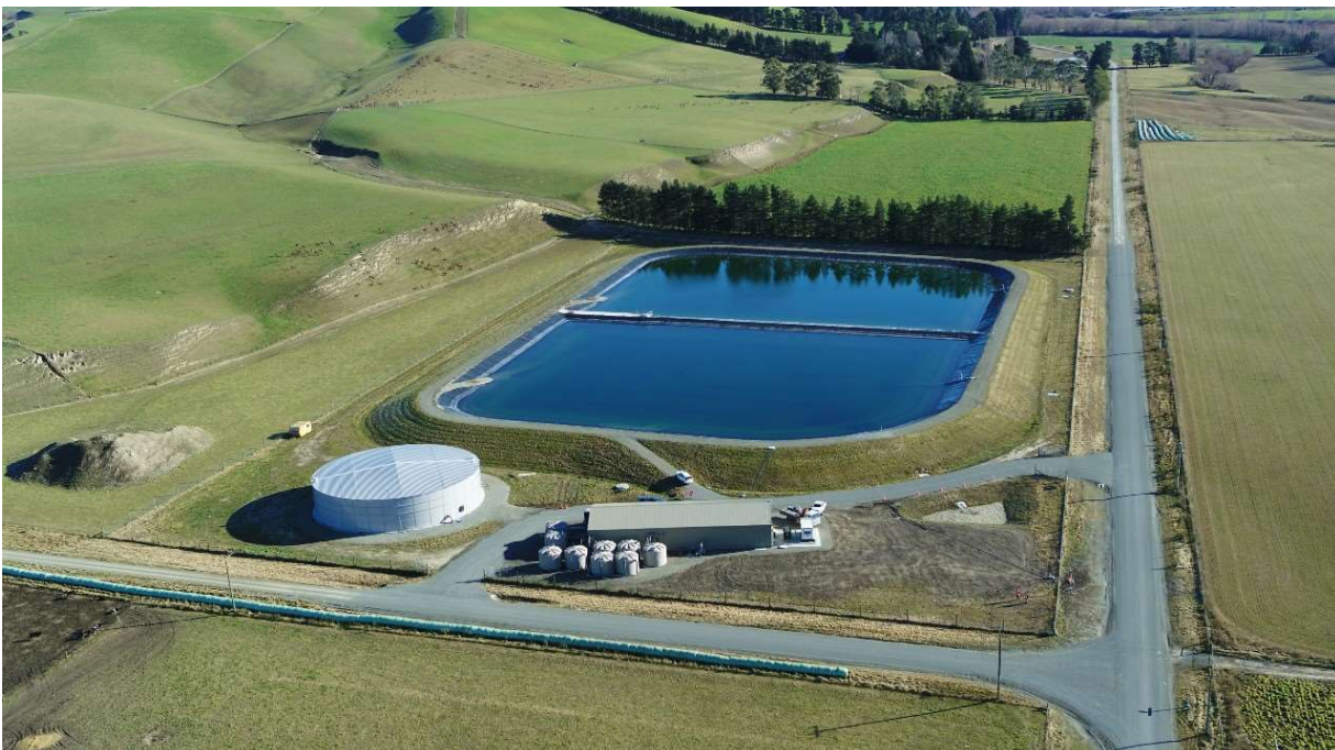
Completed Te Ana Wai Water Treatment Plant and Reservoir