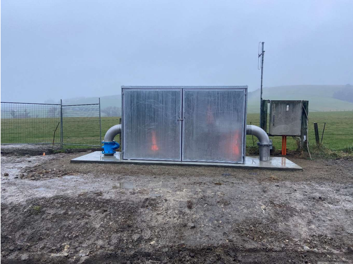
Enclosure in place for Davison Road Water Meter and Strainer