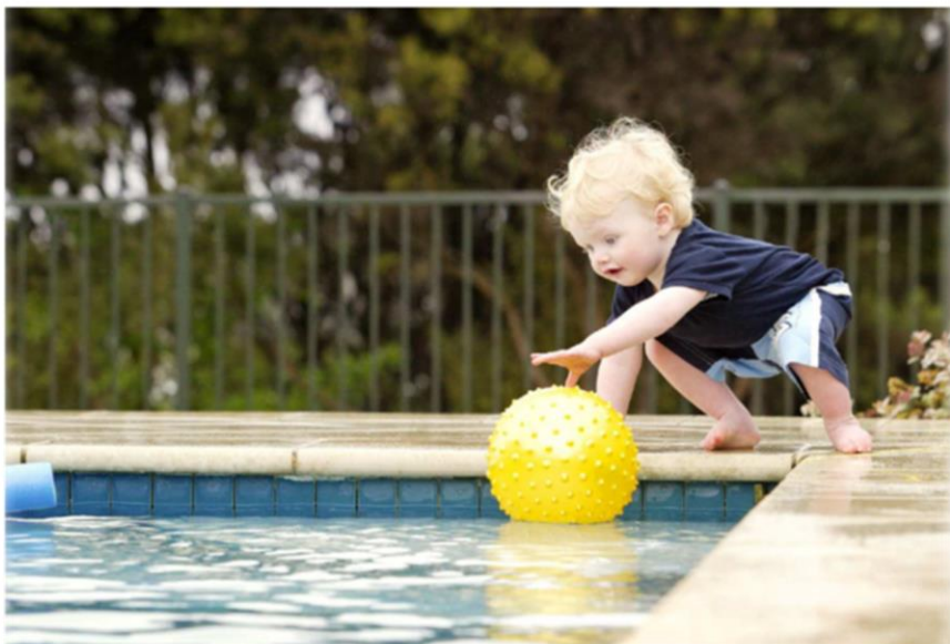
from the 'Your Pool Your Responsibility' campaign.