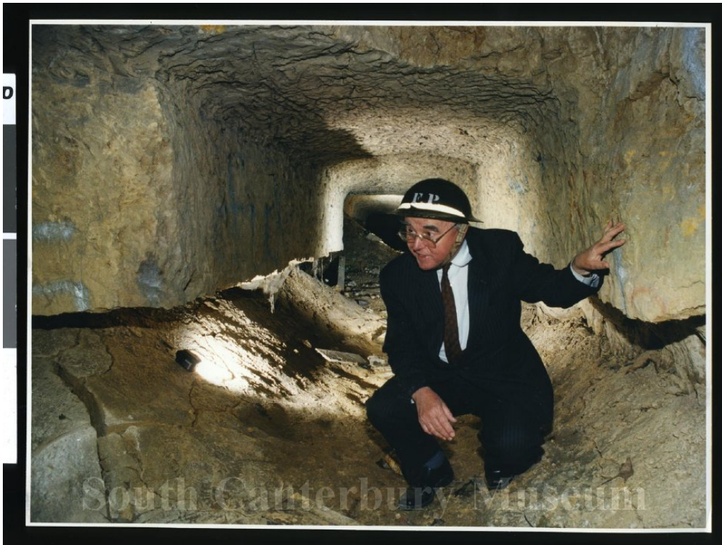
Interior of shelter, 1996.