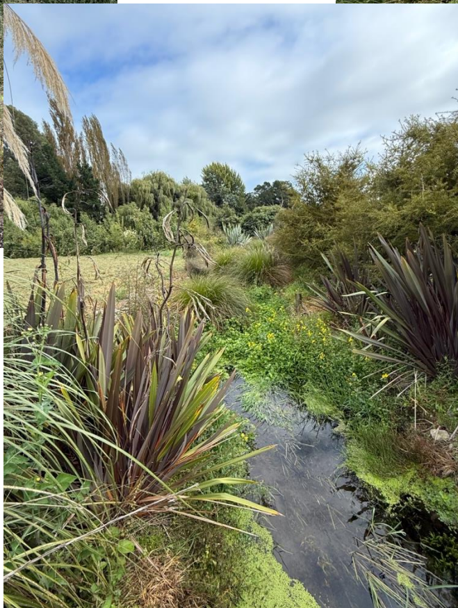
Photo Diary (February 2025): ongoing willow removal and establishing native riparian planting along Raukapuka Stream (where on our property)