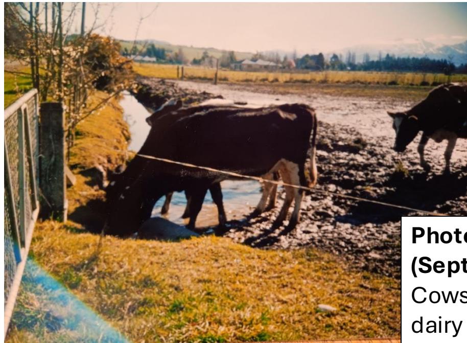
Photo Diary (September 2003): Cows from neighbouring dairy farm in the stockwater race that flowed through our property and into spring-fed Raukapuka Stream prior to the race being closed.