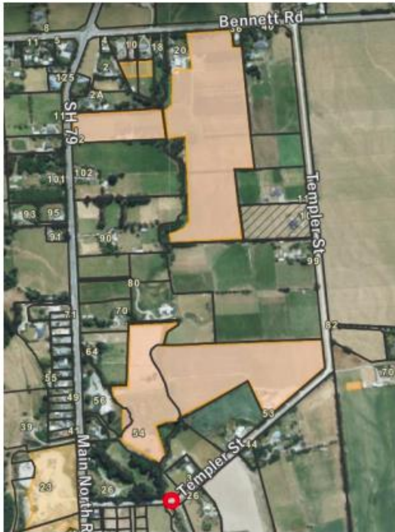
Figure 1. Listed Land Use Register (LLUR) image showing the most recent satellite imagery and listed sites (orange) and investigations (diagonal lines) for the subject site.