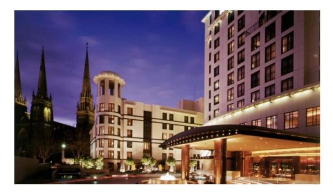
Image of Park Hyatt Hotel, Melbourne