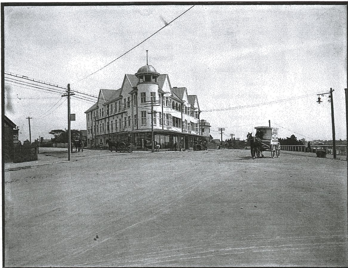
Hydro Grand Hotel, Stafford Street, Timaru, 1912, The Press collection, Alexander Turnbull Library, Ref: 1/1-008910-G. http://natlib.govt.nz/records/22497306