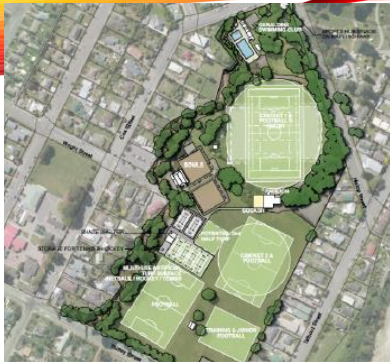
Figure 1: Preliminary Master Concept Plan for Geraldine Domain

The Preliminary Master Concept plan reflects the recommendations including: