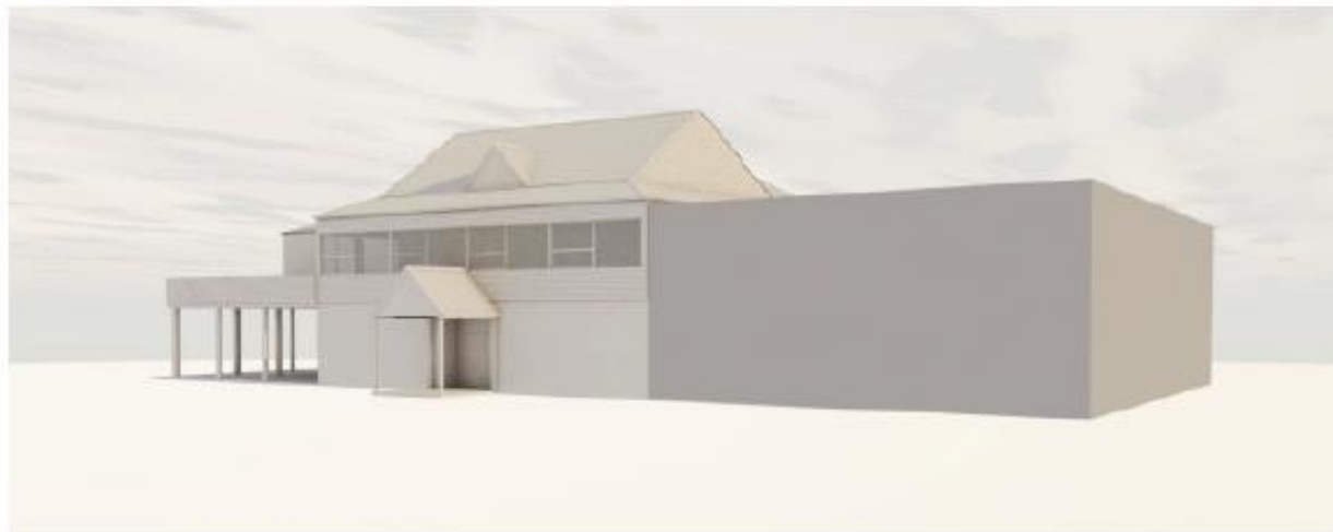
Figure 21: 3D view of Domain Pavilion from NW